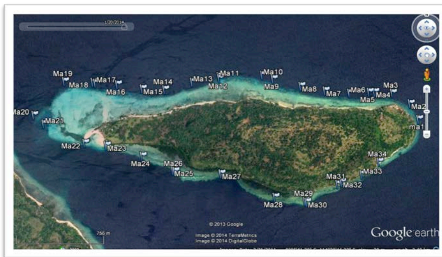
Map of mooring buoys around Menjangan Island in 2014